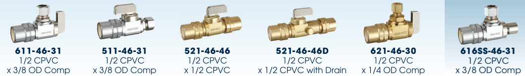
611-46-31 1/2 CPVC x 3/8 OD Comp 511-46-31 1/2 CPVC x 3/8 OD Comp 521-46-46 1/2 CPVC x 1/2 CPVC 521-46-46D 1/2 CPVC x 1/2 CPVC with Drain 621-46-30 1/2 CPVC x 1/4 OD Comp 616SS-46-31 1/2 CPVC x 3/8 OD Comp