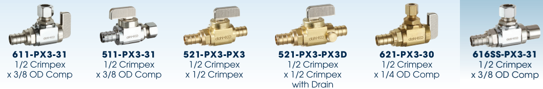
611-PX3-31 1/2 Crimpex x 3/8 OD Comp 511-PX3-31 1/2 Crimpex x 3/8 OD Comp 521-PX3-PX3 1/2 Crimpex x 1/2 Crimpex 521-PX3-PX3D 1/2 Crimpex x 1/2 Crimpex with Drain 621-PX3-30 1/2 Crimpex x 1/4 OD Comp 616SS-PX3-31 1/2 Crimpex x 3/8 OD Comp