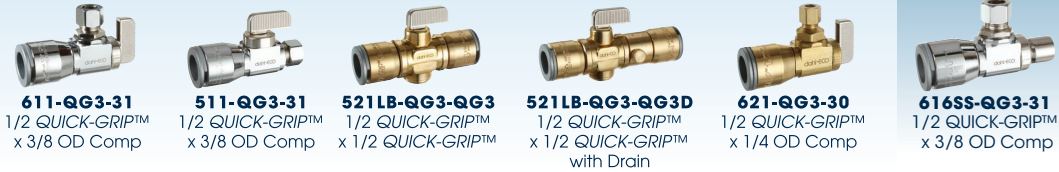
611-QG3-31 1/2 QUICK-GRIP™ x 3/8 OD Comp 511-QG3-31 1/2 QUICK-GRIP™ x 3/8 OD Comp 521LB-QG3-QG3 1/2 QUICK-GRIP™ x 1/2 QUICK-GRIP™ 521LB-QG3-QG3D 1/2 QUICK-GRIP™ x 1/2 QUICK-GRIP™ with Drain 621-QG3-30 1/2 QUICK-GRIP™ x 1/4 OD Comp 616SS-QG3-31 1/2 QUICK-GRIP™ x 3/8 OD Comp