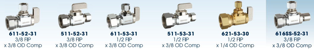
611-52-31 3/8 FIP x 3/8 OD Comp 511-52-31 3/8 FIP x 3/8 OD Comp 611-53-31 1/2 FIP x 3/8 OD Comp 511-53-31 1/2 FIP x 3/8 OD Comp 621-53-30 1/2 FIP x 1/4 OD Comp 616SS-52-31 3/8 FIP x 3/8 OD Comp