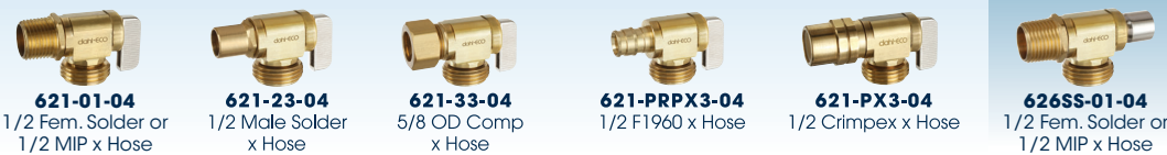
621-01-04 1/2 Fem. Solder or 1/2 MIP x Hose 621-23-04 1/2 Male Solder x Hose 621-33-04 5/8 OD Comp x Hose 621-PRPX3-04 1/2 F1960 x Hose 621-PX3-04 1/2 Crimpex x Hose 626SS-01-04 1/2 Fem. Solder or 1/2 MIP x Hose