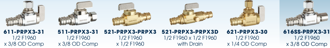
611-PRPX3-31 1/2 F1960 x 3/8 OD Comp 511-PRPX3-31 1/2 F1960 x 3/8 OD Comp 521-PRPX3-PRPX3 1/2 F1960 x 1/2 F1960 521-PRPX3-PRPX3D 1/2 F1960 x 1/2 F1960 with Drain 621-PRPX3-30 1/2 F1960 x 1/4 OD Comp 616SS-PRPX3-31 1/2 F1960 x 3/8 OD Comp