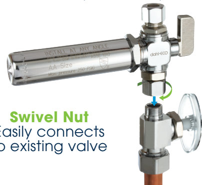
511-41-31-14WHA 3/8 OD Fem. Comp x 3/8 OD Comp x WHA

Swivel Nut Easily connects to existing valve