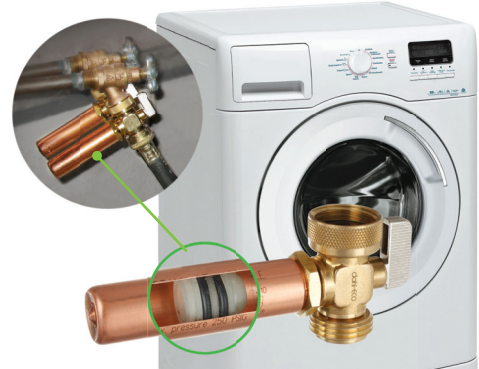
Cut-away view 521-04-04F-14WHA