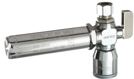
511-QG3-31-14WHA 1/2 QUICK-GRIP™ x 3/8 OD Comp x WHA